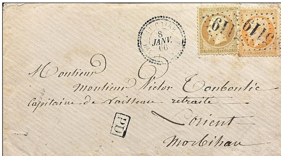
Figure 2. The earliest reported letter posted at the French P. O. at Cairo

The datestamp in Figure 1 includes the date of despatch of the cover pictured in Figure 2 . That date, 8 January 1866, is now the earliest reported date of a cover posted at the French Post Office in Cairo.