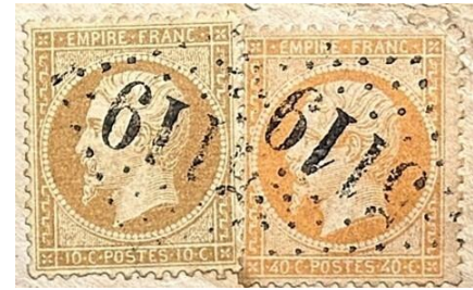
Figure 3. 40 centimes (the stamp at right) was sufficient postage. The stamp at left (10 centimes) was not necessary

From 1 January 1862, the rate for a letter of 10 grams or less between the French offices in Egypt and France was 50 centimes. On 1 January 1866, the rate was reduced to 40 centimes for letters not exceeding 10 grams ( Note 2 ). At the time the letter in Figure 2 was posted, either the staff of the French Post Office at Cairo had not been made aware of the rate reduction and applied 50 centimes postage to the letter, or the sender, unaware of the change, had come to the post office with the letter already franked with 10 and 40 centimes French perforated Empire stamps. In either case, after the recent rate reduction, the letter was overpaid by 10 centimes ( Figure 3 ).