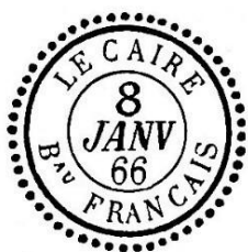
Datestamp of the Cairo French P.O.

The French Post Office at Cairo opened on 1 January 1866 as a Bureau de Distribution . The post office was issued a French date-stamp with an outer ring of dots (often referred to as “pearled”) to indicate its status. The Cairo office also received an obliterator handstamp, consisting of a diamond of dots with the number 5119 in the centre ( Figure 1 ).