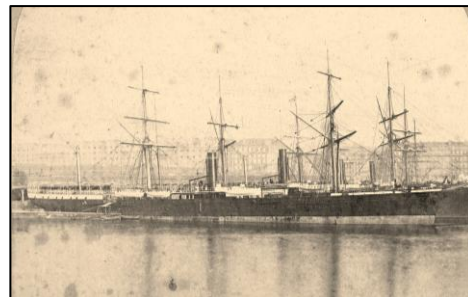
Figure 5. Paquebot Peluse .

The Peluse departed Alexandria on 9 January 1866 and followed the route illustrated in the map in Figure 6 . The vessel made stops at Messina (12 January) and Naples (13 January), before arriving at Marseille on 15 January ( Note 3 ).