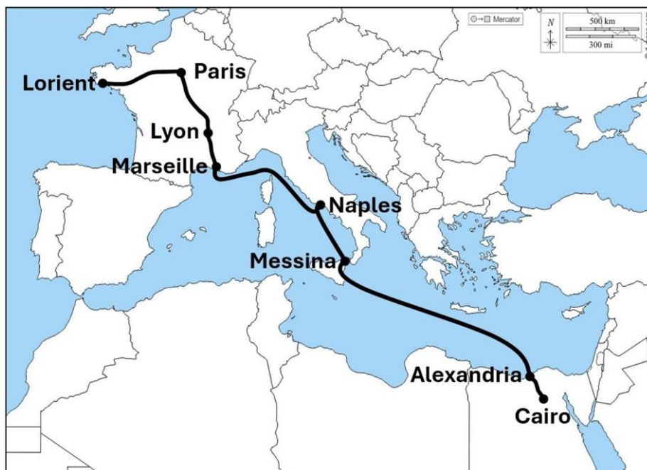
Figure 6. Route of the letter on the steamship Peluse from Alexandria to Marseille and then overland by rail across France

The reverse of the letter ( Figure 7 ) traces the route the letter travelled in France to reach its destination: After arriving at the port of Marseille, it was transferred to the train running the Marseille a Lyon travelling post office (16 January) toward Paris, where it arrived on 17 January. From the capital, on a westward train, the letter traveled to Lorient in Brittany. An 18 January receiver backstamp provides the date on which the letter arrived there, but an additional Lorient receiver indicates that it was not delivered until Friday, 19 January, 11 days in transit.