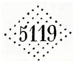
Obliterator of the Cairo French P.O.