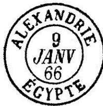
Figure 4. Alexandria transit datestamp

Having been posted at Cairo on 8 January, the letter travelled via train to Alexandria. The next day, it was processed at the French Post Office at Alexandria ( Figure 4 ) and placed aboard the French Paquebot Peluse of the Compagnie des Messageries Maritimes ( Figure 5 ). The Peluse had been launched in 1863 and operated on the Egypt line in conjunction with identical steamships, the Moeris and Saïd .